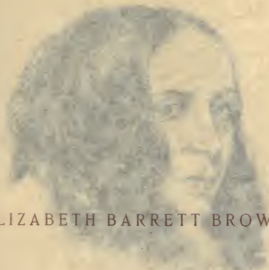
ELIZABETH BARRETT BROWNING